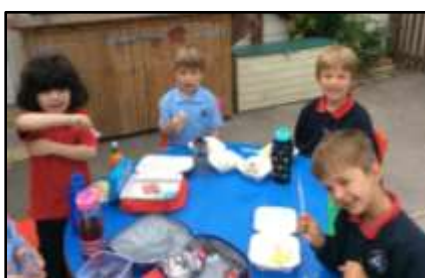
Year 1 lunch time

We would also like to remind you that the school has purchased 'Whisper-Online Reporting Tool' to allow pupils to report any concerns (regarding social media or other things) to the school. They can access this either using the Class Page on the school website or by texting 07860 021 323 using BDP1 at the start of the message.