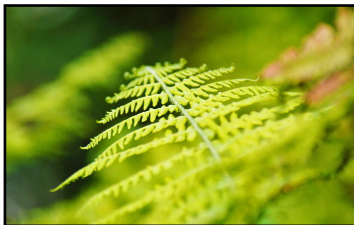
Here is his winning shot.